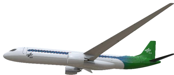
Figure 1: DLR reference aircraft F-25, retrieved from [5]; licensed under CC BY-NC-ND 3.0.

Therefore, this work describes the methodology behind the ModSiG framework, and the modification of the low-fidelity unsteady strip theory with data derived from higher-fidelity CFD simulations to sufficiently account for transonic dynamics. The derived model is numerically validated for the DLR-F25 virtual reference aircraft [4], see Fig. 1, through a comparative analysis of its longitudinal behavior against full CFD data in the time- and frequency-domains.